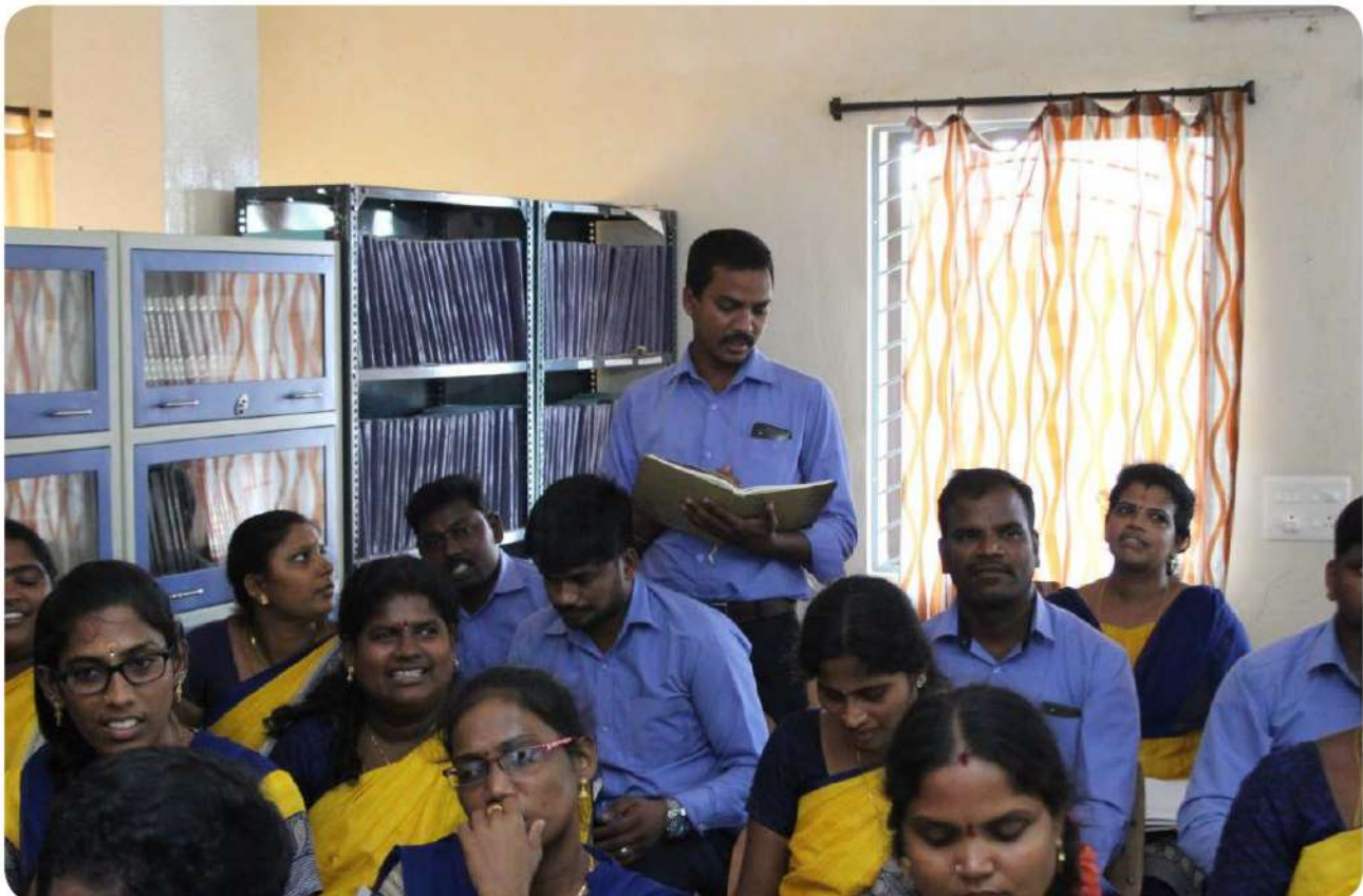
Capacity building for staff